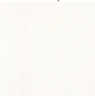
Matte White Lacquer - MWL