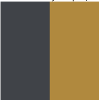
Anthracite Gray Lacquer/Gold - AGG